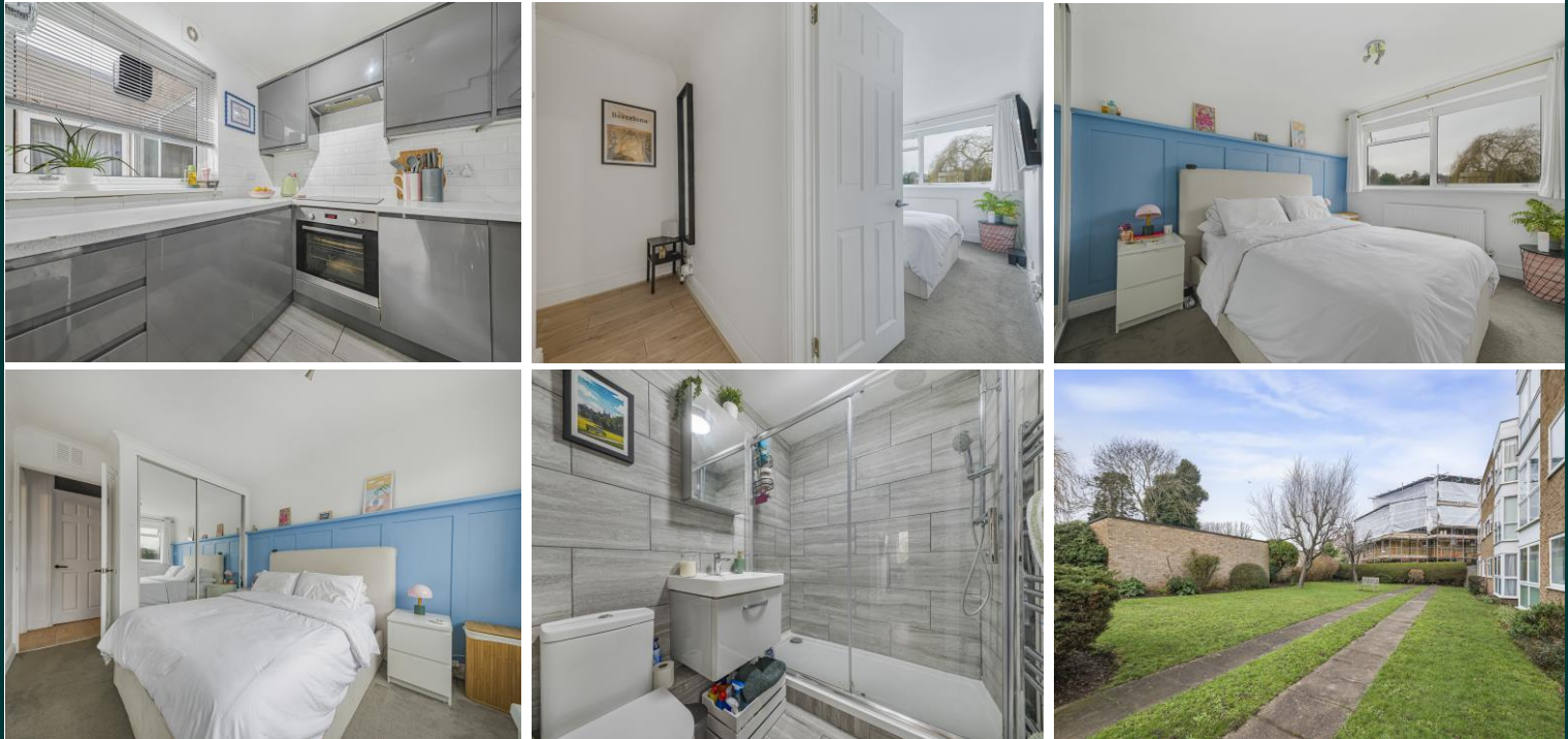
Approximate Gross Internal Area = 46.5 sq m / 501 sq ft